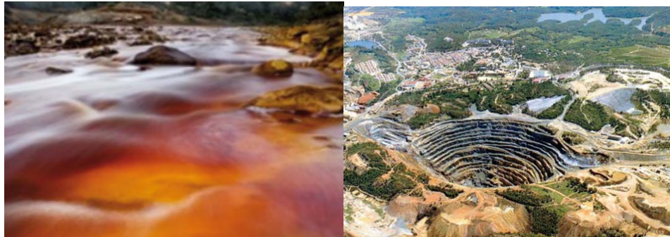
Corta Atalaya open pit (Rio Tinto Mines) and red water of the Tinto Rive

The Rio Tinto pyrite mines are located in the province of Huelva, about 80 km northwest of Seville. The giant opencast mines of Rio Tinto create a surreal, almost lunar landscape. The removal of soil and rock, in the search for several metals like gold, copper, silver, zinc, lead and others, has tinted this part of the world in reddish hues and a large range of other colors. The mining operations (since Prehistoric time), have created some pits several kilometers across.